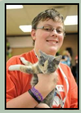
Junior Volunteer of the Year

For information on how you can become a TCHS volunteer, please visit our website at: www.tricountyhumanesociety.org/you-can-help/jobs-and-volunteering.