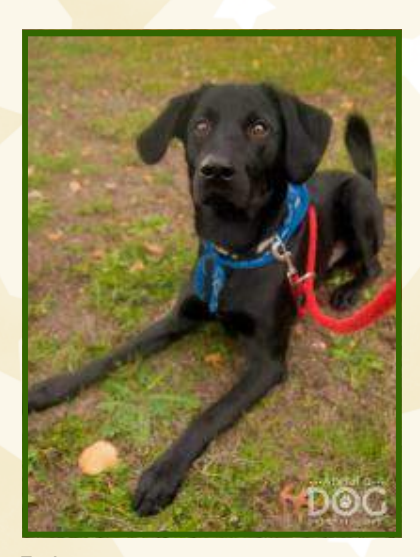
Intake: 8/13 Adoption: 10/13